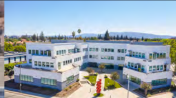
2880 STEVENS CREEK BLVD, SAN JOSE, CA 95128

THE CONNECTOR BETWEEN THE TWO MOST PROMINENT CONSUMER DESTINATIONS IN SILICON VALLEY, WESTFIELD VALLEY FAIR & SANTANA ROW